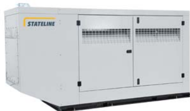
Sample Deluxe model shown