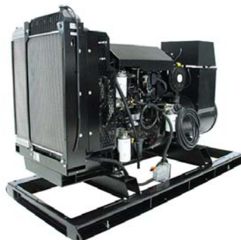
Sample unit shown w/o exhaust silencer