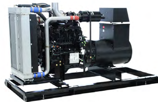
Product # SJ-100 100 kW Engine by John Deere