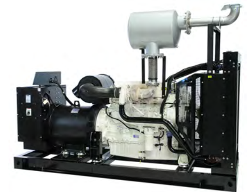
Product # SP-350 350 kW Engine by Perkins