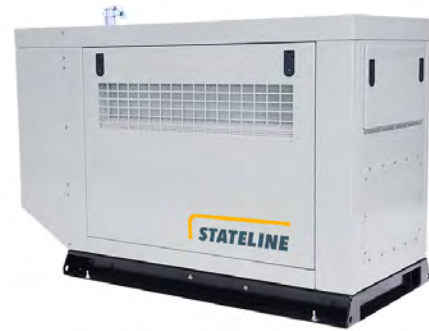
9-30 kW Models