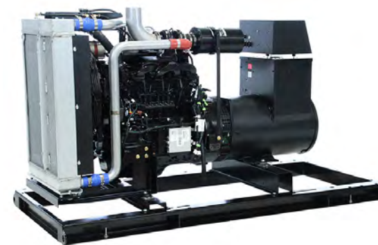
Product # SJ-100 100 kW Engine by John Deere