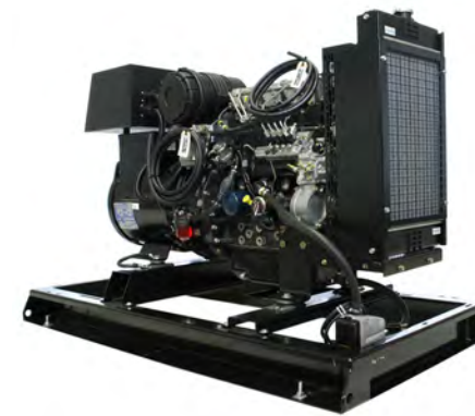
Product # SP-9 9 kW Engine by Perkins